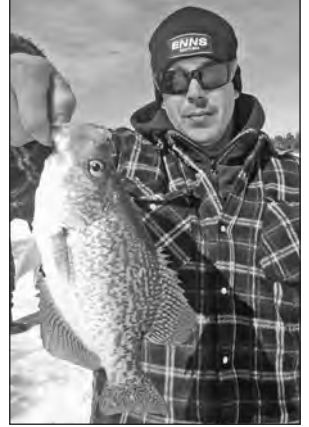
big crappie from Anderson group