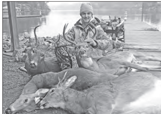
Bugsy had a good season in 2015